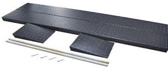
The Width Extension Kit.

To prevent hospital beds from sliding off, the hospital bed maintenance lift is supplied with a 20 mm safety lip around the sides, as well as a Width Extension Kit (pictured below) for an additional 600 mm on each side.